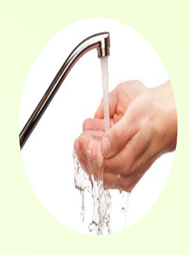
HAND WASHING IS THE FIRST LINE OF DEFENSE!